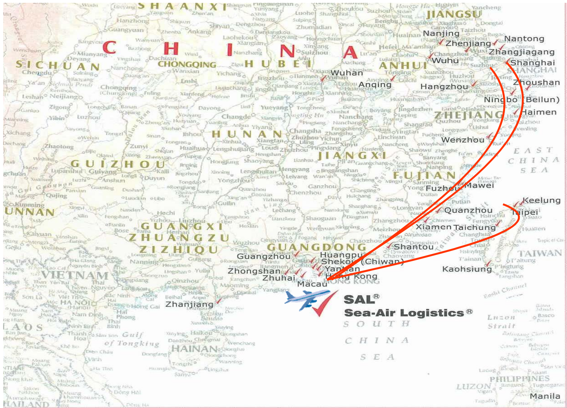
✓ SAL Sea-Air Logistics® in HKG & China